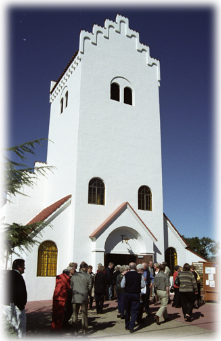
Solvang, February 2002