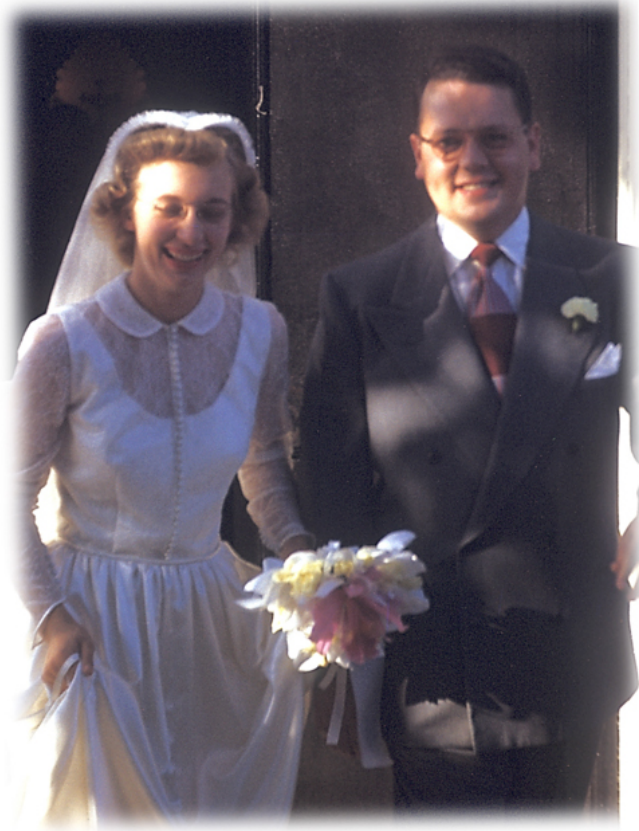
First weddings both in old Fredsville church