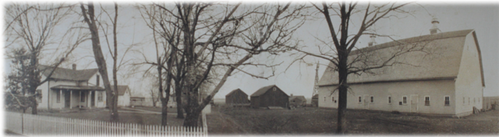
Farm Homestead in 1916 Located 3 miles west & 3 miles south of Dike, Iowa Barn built about 1915, a new house was built in 1919